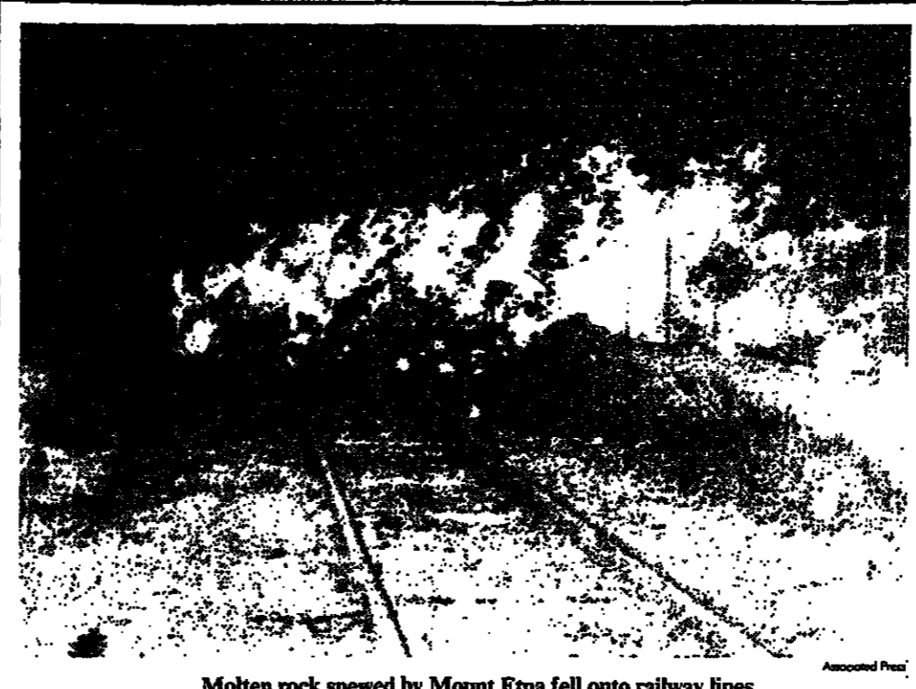
Molten rock spewed by Mount Etna fell onto railway lines.